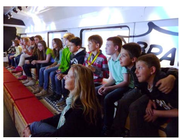
Learning in the SBB educational train