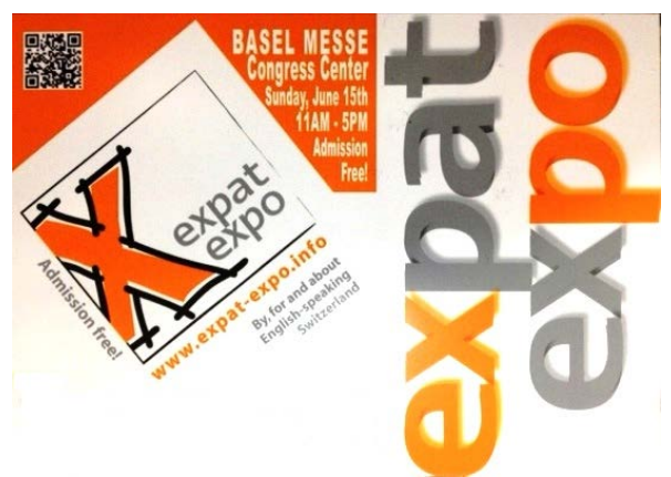
SIS Basel will have a booth at the Expat Expo in the Messeplatz Congress Center on Sunday, June 15, from 11 a.m. to 5 p.m. Admission free - pass the word!