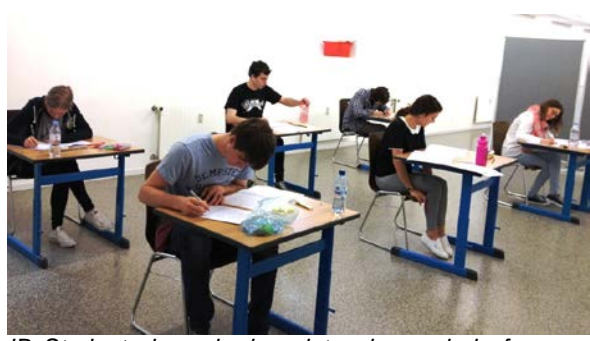
IB Students have had an intensive period of exams lately - with still more to come. Almost there!

http://www.swissinternationalschool.ch/Schulstandorte/Basel /Allgemeine-Infos/Video-SIS-Basel