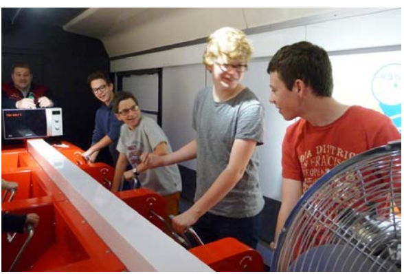
Working hard to power a microwave to pop popcorn