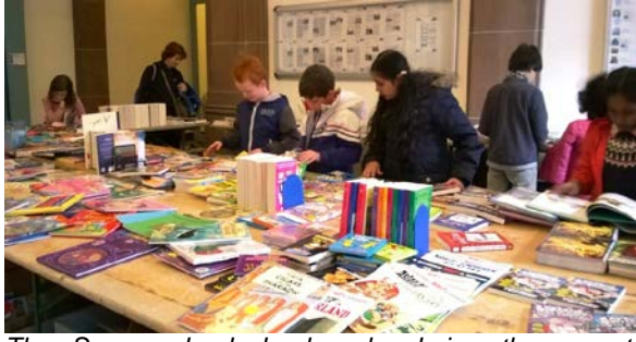
The Summersbook book sale during the parentteacher conferences drew great interest

If you would like to participate in the planning and/or help at the event itself, a sign-up sheet will be posted in the school foyer next week, or contact us at the email above or via your class rep