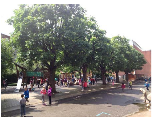
Spring weather has brought ups and downs after a summery start, but kids still know how to make the most of playtime, no matter what!

Car for sale: Ford CMax TDCi 1.6 Duratorq 109 Cv Ghia—CHF 12.400. Diesel engine. First registration in 08/2009, 70.500 km, very good shape. Imported in Switzerland and registered end of January 2014, car inspection in